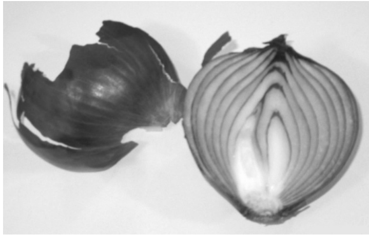
Figure 1-1: The onion analogy of the Torah.

Torah and some of the books of the prophets. I would agree with that comparison, but I would add that you should look at the Torah like an onion (Figure 1-1).